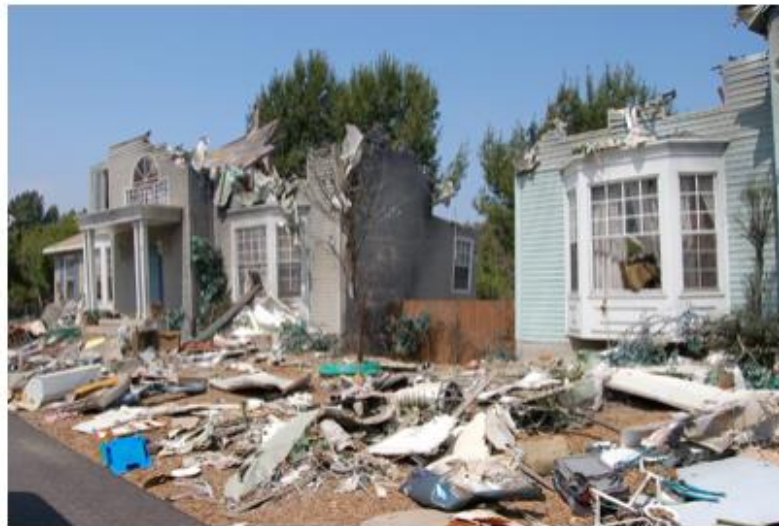
Home & business disaster loans