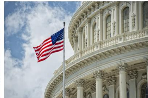
Federal government contracting