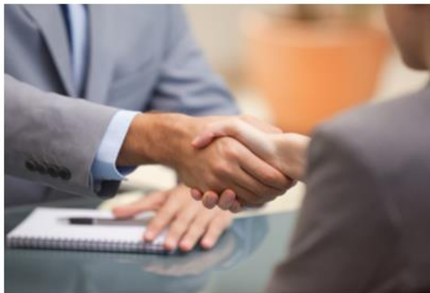
SBA guaranteed business loans