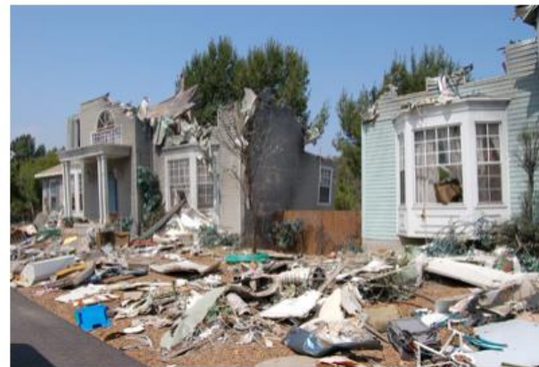
Home & business disaster loans