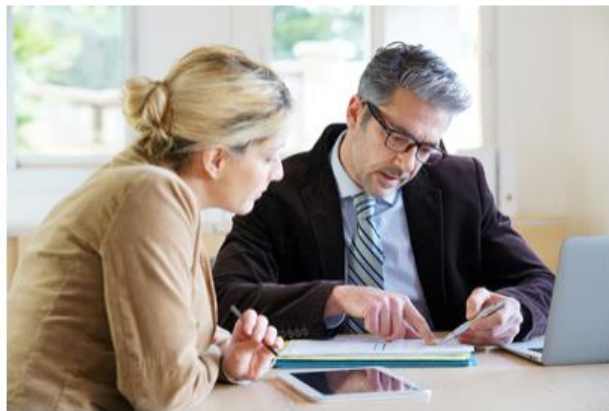
Free business counseling